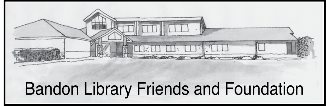
Bandon Library Friends and Foundation