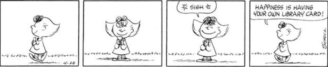
Peanuts by Charles M. Schultz